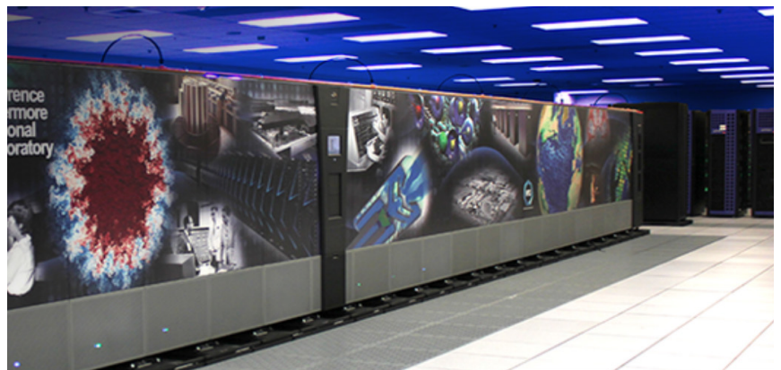
The Spectra TFinity ExaScale Tape Library on site at Lawrence Livermore National Laboratory.